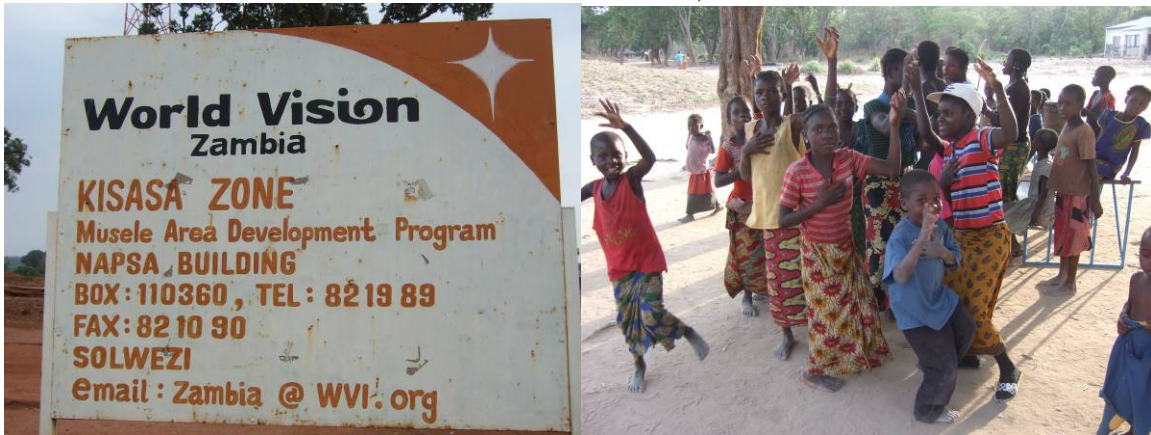
CHILDREN DANCING ON THE OCCASION OF LAUNCHING THE TRAINING IN MUSANGEJI AREA