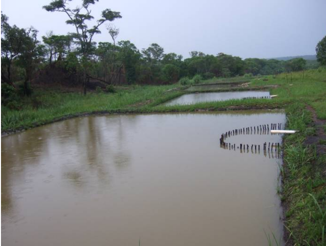
Adequate water flow coming out of the fish ponds to be utilized for irrigating paddy rice fields