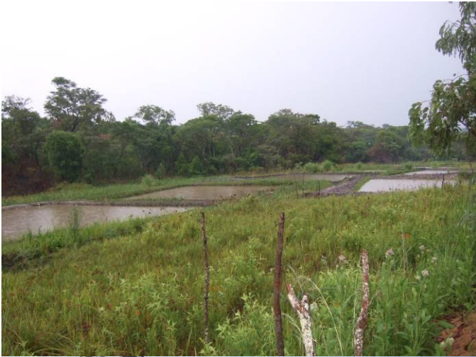
Suitable land surrounding the fish pond planned for paddy rice growing